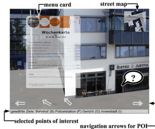
Figure 2: Example: Acquisition of information about "Bistro Justitia"

Some parts of the city of Kaiserslautern are supposed to be integrated in the 3D model. The digital reconstruction of every building can be compared to the manufacturing of a new car. The product lifecycle management (PLM) system creates every reconstruction. A multimedia system based on 3D geometry will be developed in conjunction with additional information like video, text or audio. (Figure 2)